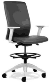
Mid-Back Task Stool