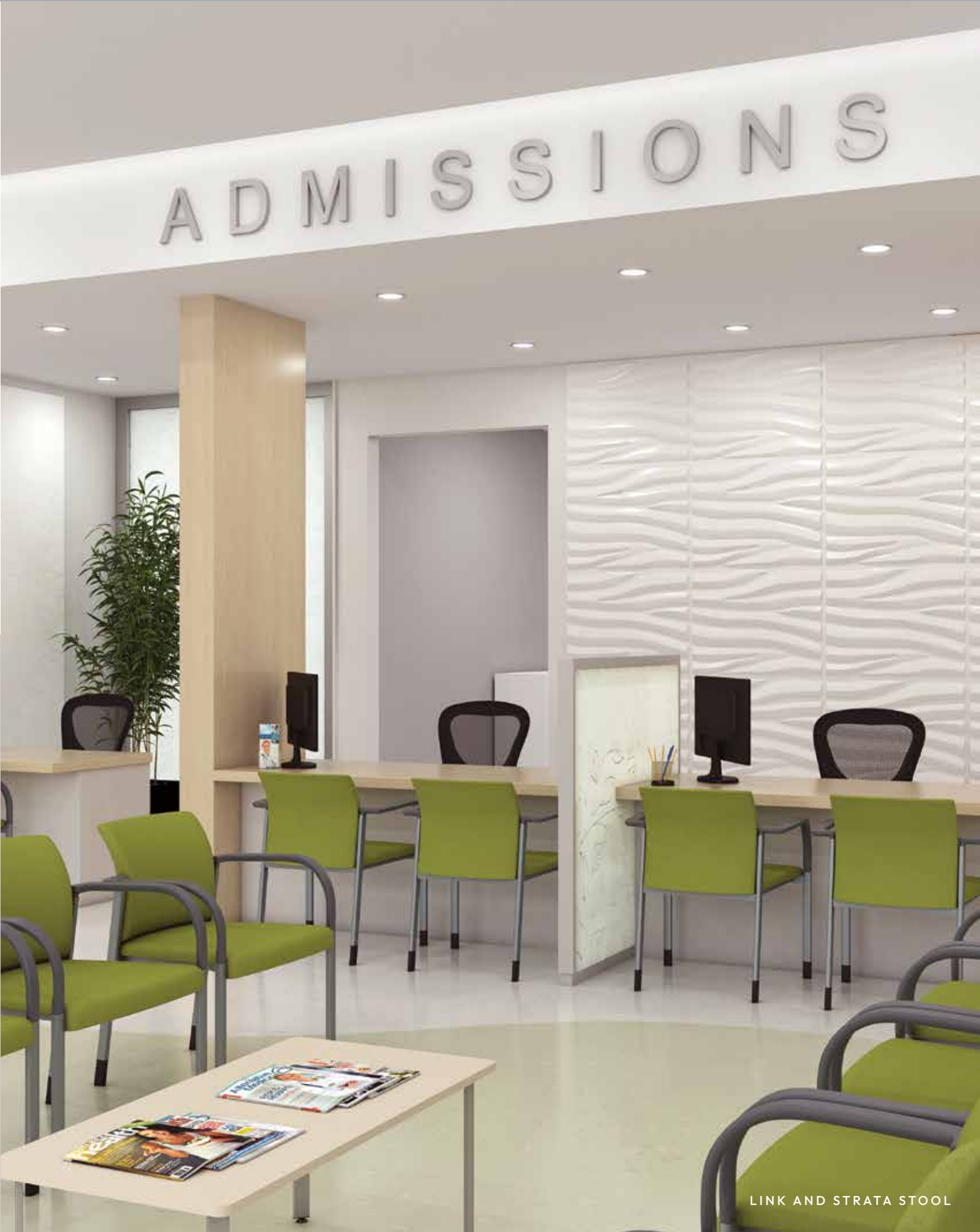
LINK AND STRATA STOOL

Around-the-clock activity calls for task and guest seating built to withstand heavy usage. Link guest, Strata task, and Tori task chairs meet these demands and more—making them a smart, durable choice for the admissions area.