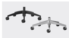
@305 Nylon Base, Black @306 Base, Polished