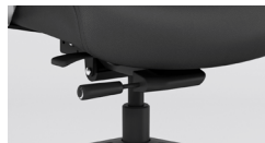
Y2 Heavy Duty Synchro Tilt