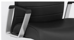
A52 Fixed Arm