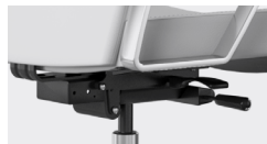
Y2 Heavy Duty Synchro Tilt