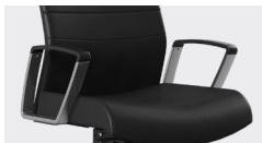
A52 Fixed Arm