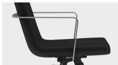
A24C Fixed Wraparound Arm Polished