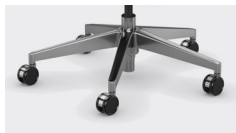
BA12P 27" Mid-Profile Aluminum Base - Polished