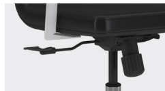
S3 Swivel Tilt