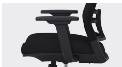
2-Way Adjustable Arms