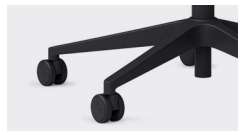
BA12B 27" Mid-Profile Nylon Base - Black