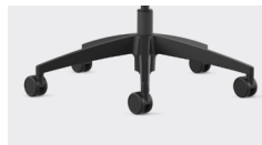
27" Mid-Profile Nylon Base - Black