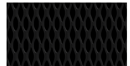
T01 Air Mesh - Black

5 year warranty on all structural and mechanical components. Fabric and foam are warranted against wear through and deterioration for five years.