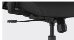
Y1 Simple Synchro Tilt