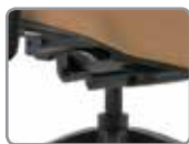
Y2 HEAVY DUTY SYNCHRO TILT