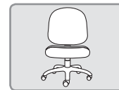
HD HEAVY DUTY MULTI-SHIFT UPGRADE 350 LB. INCLUDES BA10 AND C6S. AVAILABLE WITH Y2 ONLY.