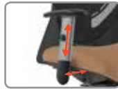
A9B/S HEIGHT/WIDTH ADJUSTABLE ARM - BLACK/SILVER