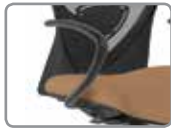
A10 SOFT TOUCH C-SHAPED ARM