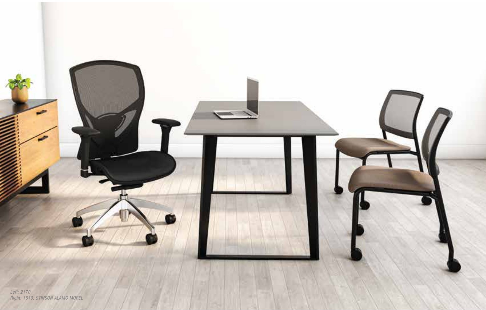
Left: 2170 Right: 1510; STINSON ALAMO MOREL