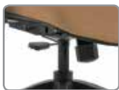
Y1 SIMPLE SYNCHRO TILT