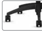
BA11B MID-PROFILE NYLON BLACK