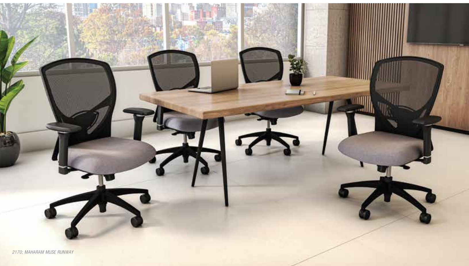
2170; MAHARAM MUSE RUNWAY