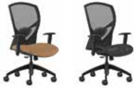
2170 US MID-BACK