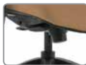
Y3 FULL SYNCHRO TILT