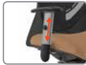
A8B/S HEIGHT ADJUSTABLE ARM BLACK/SILVER