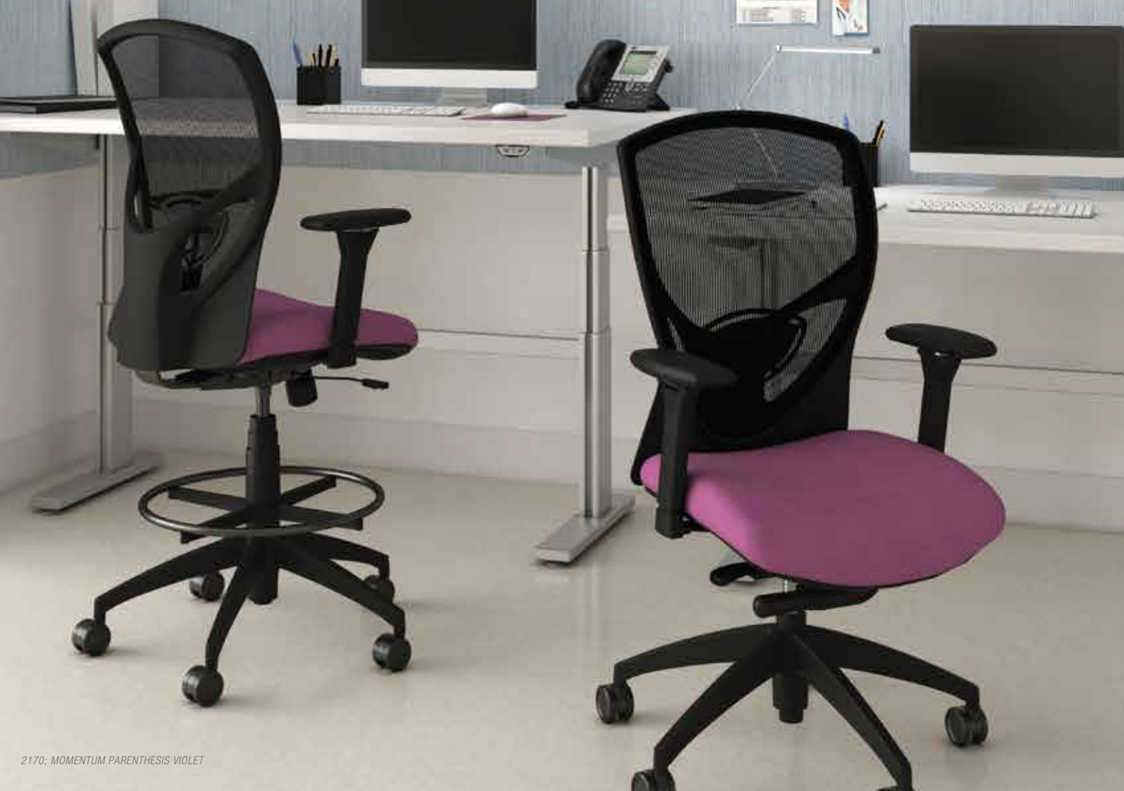
2170; MOMENTUM PARENTHESIS VIOLET