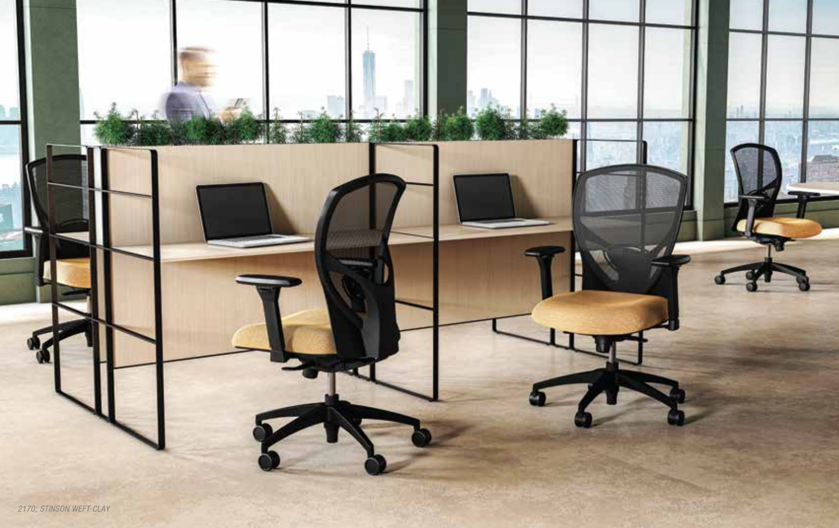
2170; STINSON WEFT CLAY