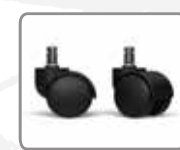
C1S 50MM HOODED HARD FLOOR CASTERS