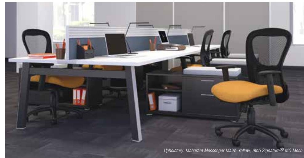
Upholstery: Maharam Messenger Maize-Yellow, 9to5 Signature® MO Mesh

Ergonomic and sleek design makes it a great choice for task, managerial and executive applications. Adjustable lumbar support, synchro tilt control, multiple arms, mesh and upholstery options allow you to customize the Strata Lite for your office needs.