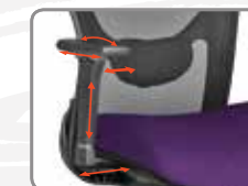
A37 HEIGHT/WIDTH ADJUSTABLE PIVOT/SLIDE ARM