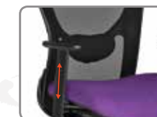
A8 HEIGHT ADJUSTABLE ARM