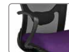
A10 SOFT TOUCH C-SHAPED ARM