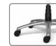
BA2P 26" ALUMINUM BASE POLISHED