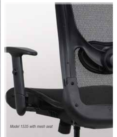
Model 1535 with mesh seat