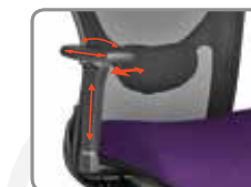
A36 HEIGHT ADJUSTABLE PIVOT/SLIDE ARM