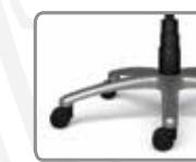
BA2S 26" ALUMINUM BASE SILVER POWDER COAT