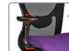
A6/A7 A6 - HEIGHT ADJUSTABLE PIVOT/ SLIDE ARM A7 - HEIGHT/WIDTH ADJUSTABLE PIVOT/SLIDE ARM