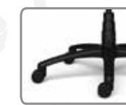
BA2B 26" ALUMINUM BASE BLACK POWDER COAT