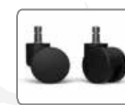
C4 60MM HOODLESS CASTERS