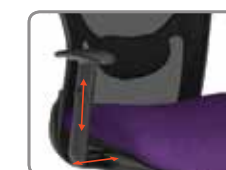
A9 HEIGHT/WIDTH ADJUSTABLE ARM