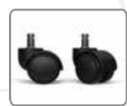
C2S 50MM HOODED SELF-LOCKING HARD FLOOR CASTERS