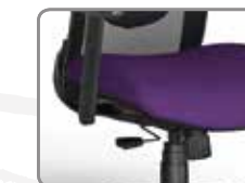
Y1 SIMPLE SYNCHRO