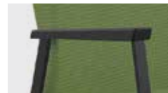
A80B Soft Touch Pad - Black