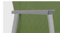
A80G Soft Touch Pad - Gray