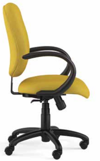
Front Cover: 1760-S2-A4-BA1-C1; Maharam Pick 006 Masala Top: 1725-B2-A4-BA1-C1; Manner Butterscotch Bottom: 1760-S2-A16-BA1-C1; Manner Butterscotch

DESIGNED FOR COMFORT The seats and backs are made of highly resilient molded foam. A waterfall seat promotes circulation and good health.