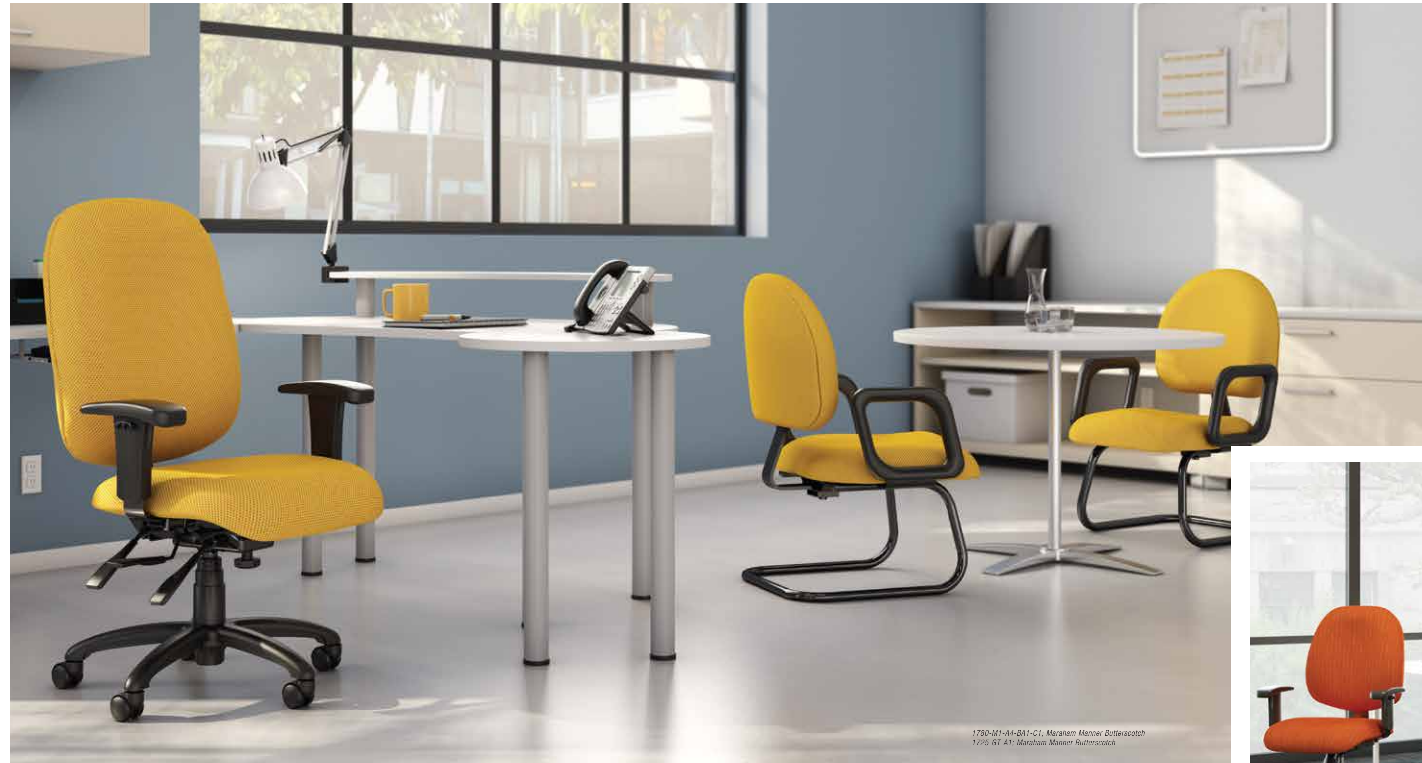
1780-M1-A4-BA1-C1; Maraham Manner Butterscotch 1725-GT-A1; Maraham Manner Butterscotch