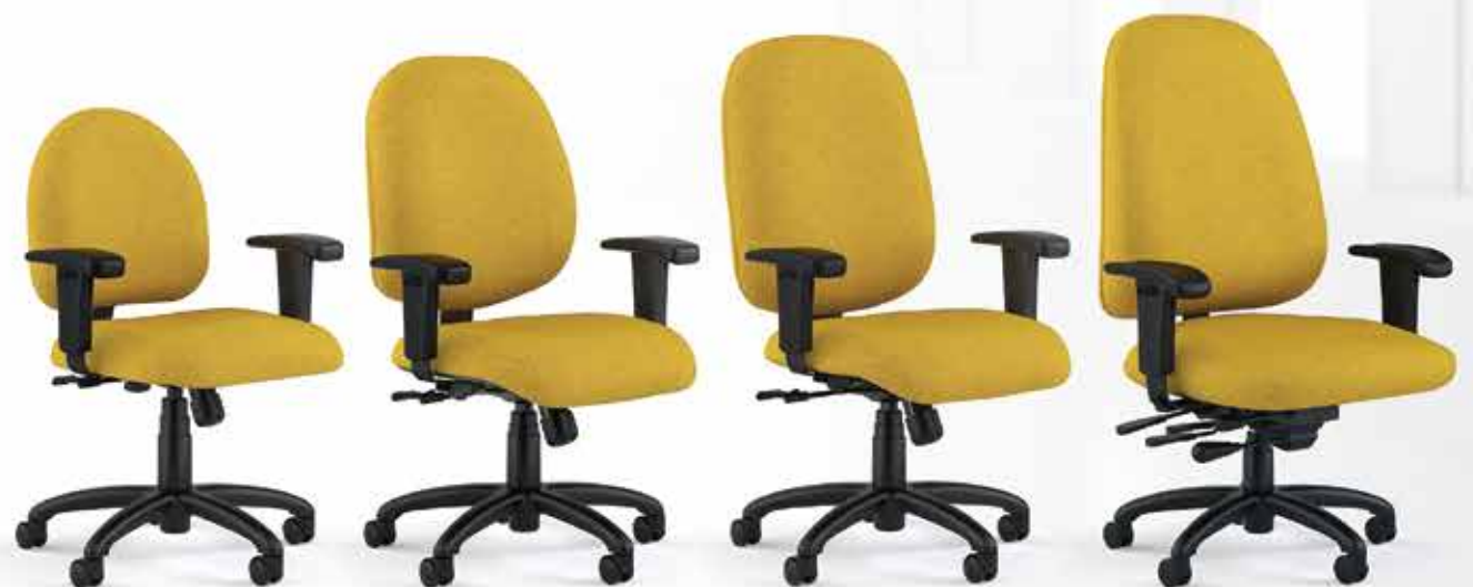
1725 LOW-BACK 1760 MID-BACK 1780 HIGH-BACK 1790 LOGIC PLUS

Meet the family, our complete Logic series offers a broad selection of executive, task, side and stool models in low back, mid back, high back and plus sizes. Customizable models for every room in the office or institution.