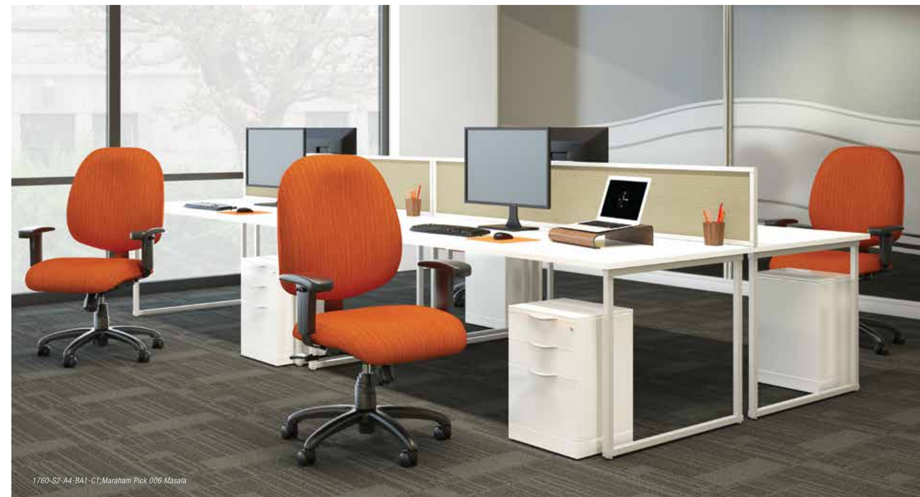
1760-S2-A4-BA1-C1; Maraham Pick 006 Masala