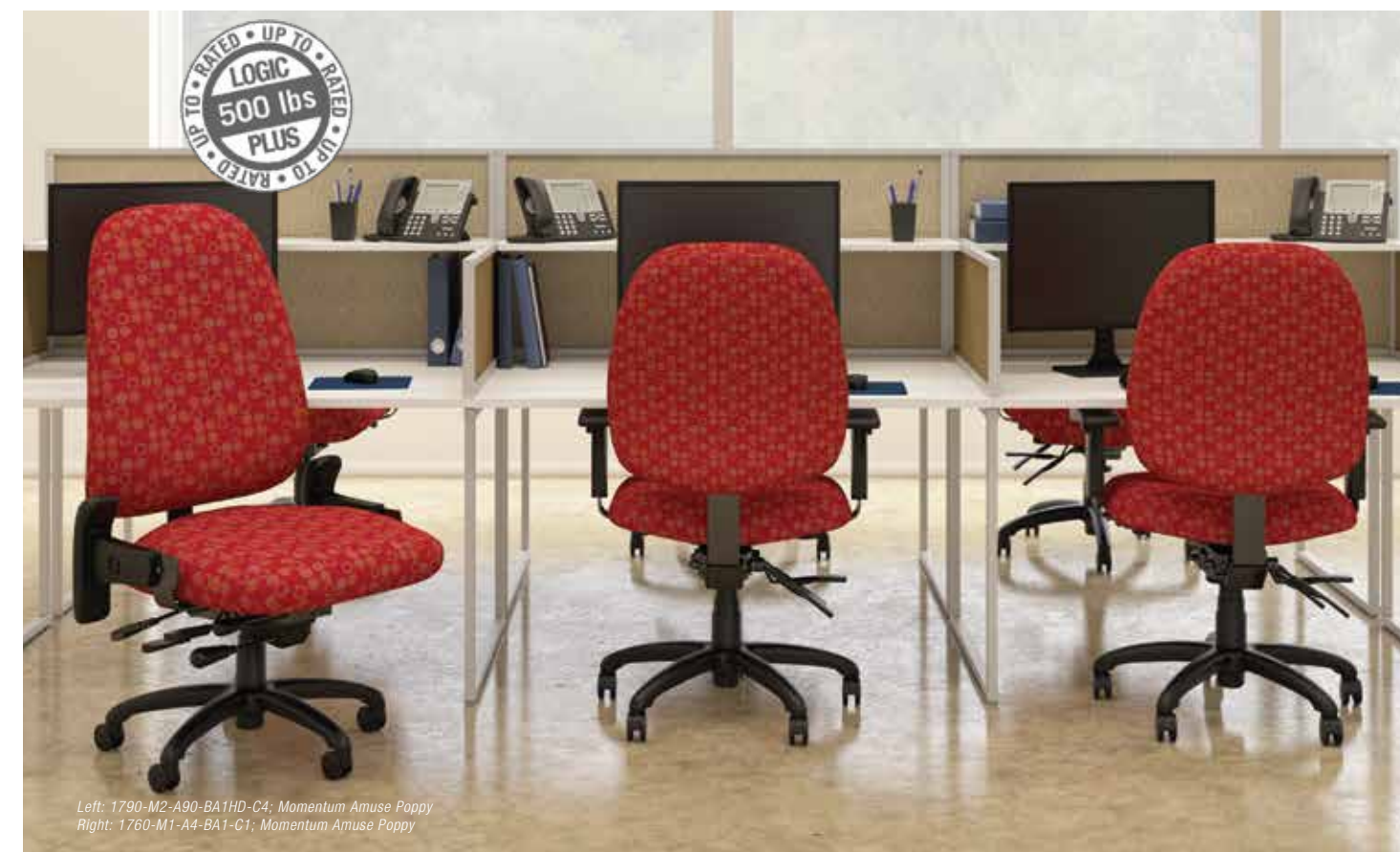
Left: 1790-M2-A90-BA1HD-C4; Momentum Amuse Poppy Right: 1760-M1-A4-BA1-C1; Momentum Amuse Poppy