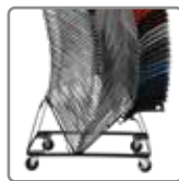
DL5 STACKING DOLLY STACKS UP TO 20 HIGH