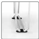
GC5 GANGING CLIP - 4 PER SET ARMLESS-TO-ARMLESS