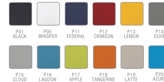
P01 BLACK P05 WHISPER P11 FEDERAL P12 CRIMSON P13 LEMON P14 DOVE P15 CLOUD P16 LAGOON P17 APPLE P18 TANGERINE P19 LATTE P20 AZURE