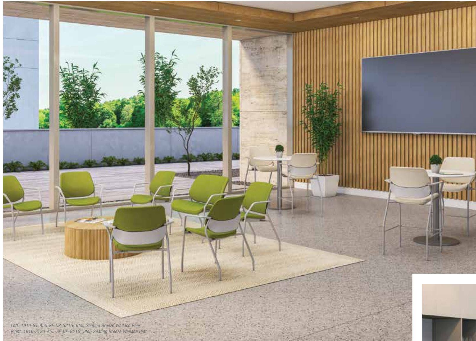
Left: 1910-GT-A55-SF-UP-G21G; 9to5 Seating Breeze Wallace Pear Right: 1910-ST30-A55-SF-UP-G21G; 9to5 Seating Breeze Wallace Hlot