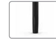
G21B/G TAPERED PLASTIC GLIDE BLACK/GRAY