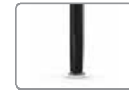
G21B/GN SWIVEL NYLON GLIDE BLACK/GRAY