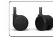
C12S HARD FLOOR AND CARPET CASTERS