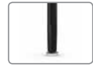
G21BF/GF SWIVEL FELT GLIDE BLACK/GRAY