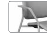
A55B/G NYLON FIXED ARM