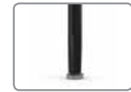
G21BS/GS SWIVEL STEEL GLIDE BLACK/GRAY