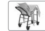
DL5 STACKING DOLLY