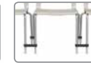
GC9 GANGLING CLIP