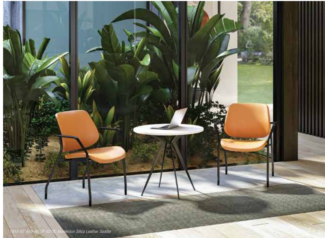
1910-GT-A55-BF-UP-G21R; Momentum Silica Leather Saddle