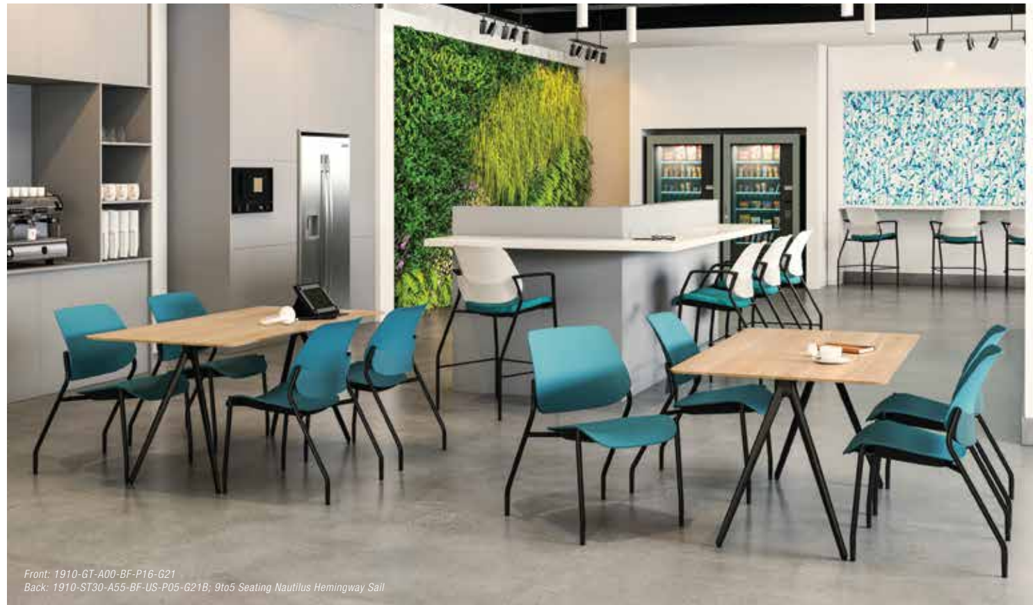
Front: 1910-GT-A00-BF-P16-G21 Back: 1910-ST30-A55-BF-US-P05-G21B; 9to5 Seating Nautilus Hemingway Sail