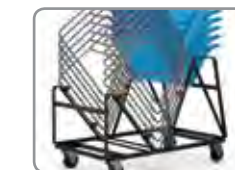
DL4 STACKING DOLLY STACKS UP TO 40 HIGH (WITH ALL PLASTIC SLED BASE) STACKS UP TO 12 HIGH (WITH ALL PLASTIC 4 LEG)