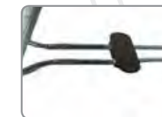
GC5 GANGING CLIP 4 PER SET, ARMLESS ONLY 2" BETWEEN CHAIRS WHEN GANGED (FOR SLED MODELS)