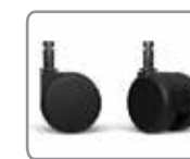
C12 50MM HOODLESS CASTER