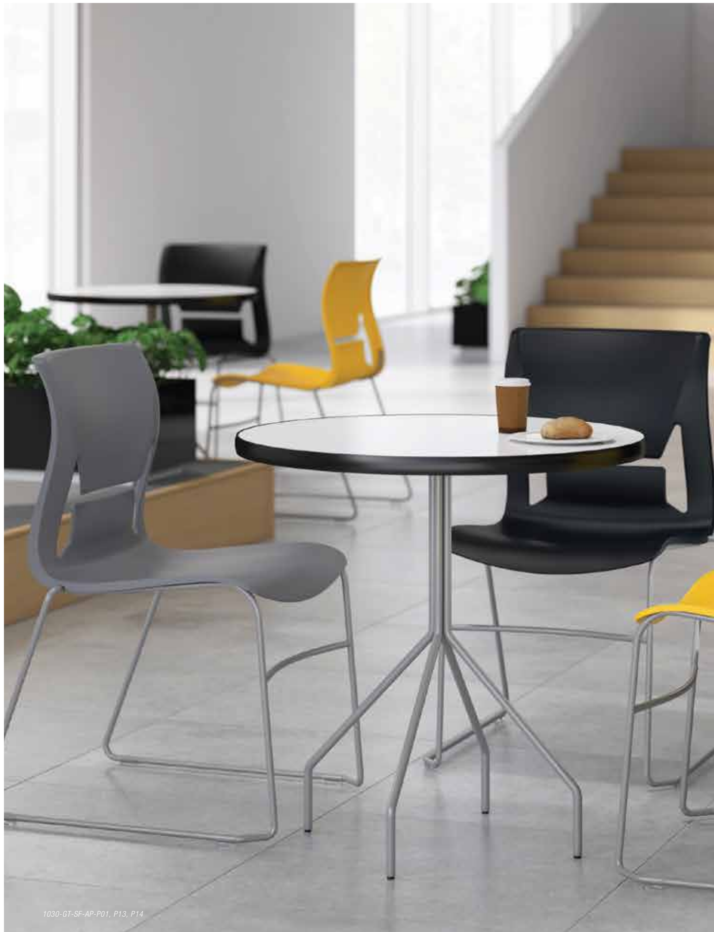
1030-GT-SF-AP-P01, P13, P14