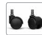
C65 50MM HOODED HARD FLOOR CASTER