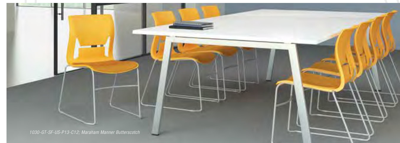
1030-GT-SF-US-P13-C12; Maraham Manner Butterscotch