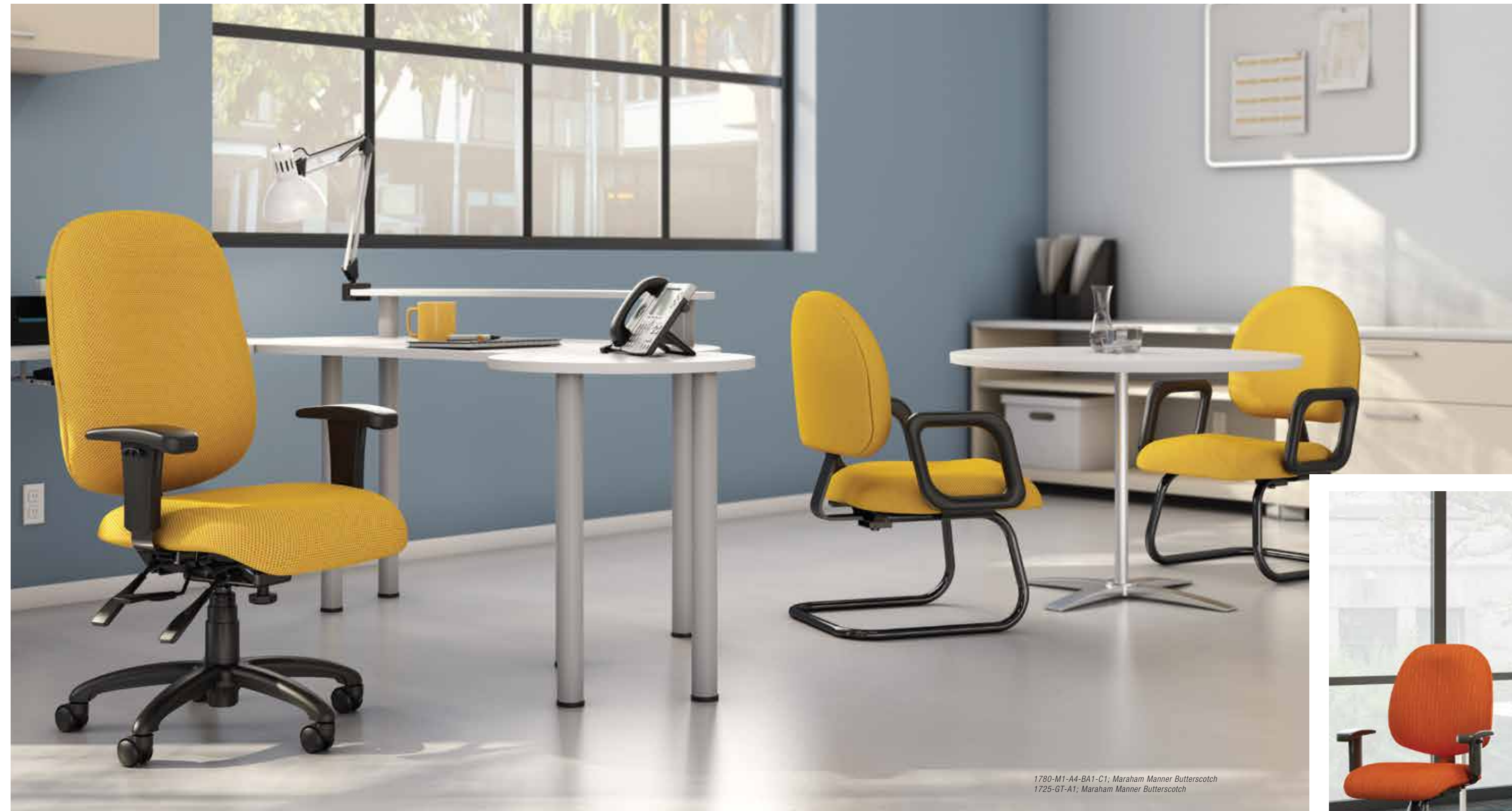
1780-M1-A4-BA1-C1; Maraham Manner Butterscotch 1725-GT-A1; Maraham Manner Butterscotch