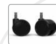
C6 60MM HOODLESS CASTERS