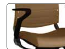
A31 BLACK SOFT TOUCH FIXED CANTILEVER ARM