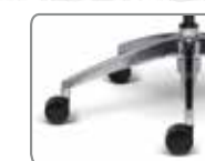
BA10P 26" HIGH PROFILE POLISHED ALUMINUM BASE