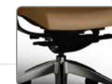
X2 11 POSITION MULTI-LOCK SYNCHRO-TILT PADDLE CONTROL