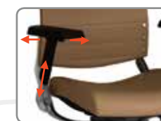
A32 4-WAY ADJUSTABLE ARM