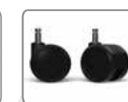
C6S 60MM HOODLESS HARD FLOOR CASTERS