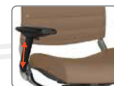
A38 2-WAY HEIGHT ADJUSTABLE ARM