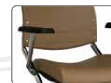
A33 FIXED ARM WITH SOFT POLYURETHANE PAD FOR GT MODELS ONLY