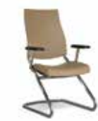
GUEST 322 a0-GT