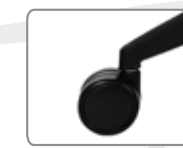
C6 60MM LARGE DIAMETER CASTER