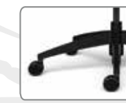
BA11B 27" MID-PROFILE NYLON BASE - BLACK