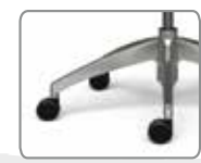
BA12P 27" MID-PROFILE ALUMINUM BASE - POLISHED