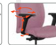
A37 10-WAY MULTI-ADJUSTABLE PIVOT/SWIVEL ARM WITH ADDED WIDTH ADJUSTMENT