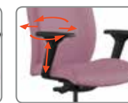
A36 8-WAY ADJUSTABLE PIVOT/ SWIVEL ARM