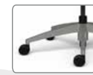
BA11G 27" MID-PROFILE NYLON BASE - GRAY