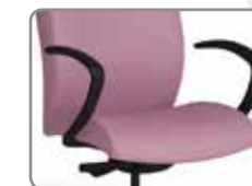
A10 BLACK SOFT-TOUCH CANTILEVER C-SHAPE ARM