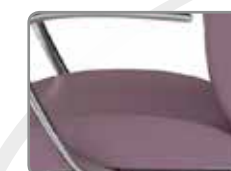
A27 POLISHED ALUMINUM C-SHAPE ARM WITH UPHOLSTERED PAD