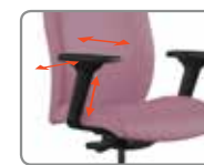
A23B/G 6-WAY ADJUSTABLE ARM BLACK/GRAY WITH BLACK SLIDING ARM PAD