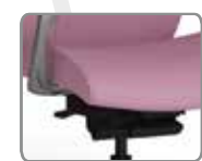
Y2 SYNCHRO TILT 3 PADDLE