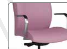
A19 POLISHED ALUMINUM C-SHAPE ARM