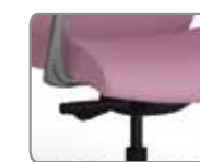
W2 WEIGHT BALANCED SYNCHRO - 1 PADDLE