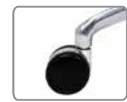
C7 60MM CHROME ACCENTED HOODLESS CASTERS

9to5 Seating offers Acclaim in a wide selection fabric and leather as well as COM and COL.