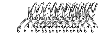
First Chair 25", Each Additional Chair, Add 8"

CAUTION: Careless nesting of chairs may scratch and damage frames.