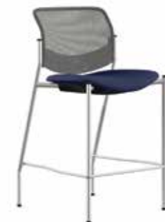
shuttle mesh stool