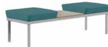
sophie bench with table

Multi-purpose areas are on the rise. One space can host comfy lounges, individual workstations, group settings, and more. This requires flexible seating in a variety of sizes to support a broader range of learning.